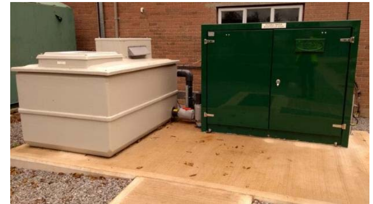
Potable Booster Pumping Station